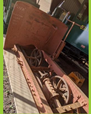
The Flyer restoration project....