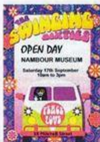
A promotional poster announcing the Swinging Sixties event at Nambour Museum.

On the roads, Nambour's GMH dealership Williams