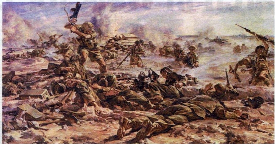
Famous artistic impression of the battle scene faced by members of the 2/15th Battalion during Operation Bulimba on 1st September 1942.

The 2/15th Battalion Remembrance Club which was based in Brisbane provided members and guests with an opportunity to socialise, reflect and participate in the annual Anzac Day March. With