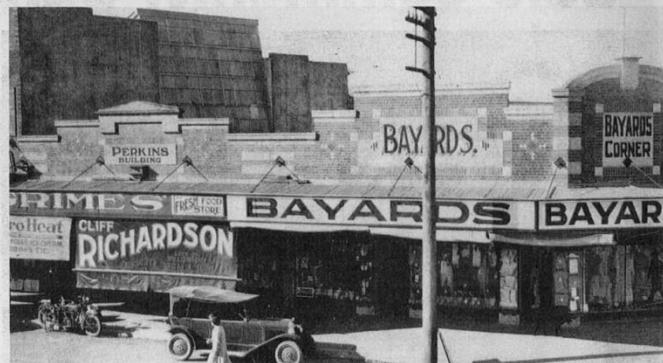
The famous Bayards Store, located at the time at the corner of Currie and Howard Streets.

In Nambour, some of the larger iconic business names which come to the fore include Bayards, Whalleys, Lowes, Chadwicks and Penneys. At stores like