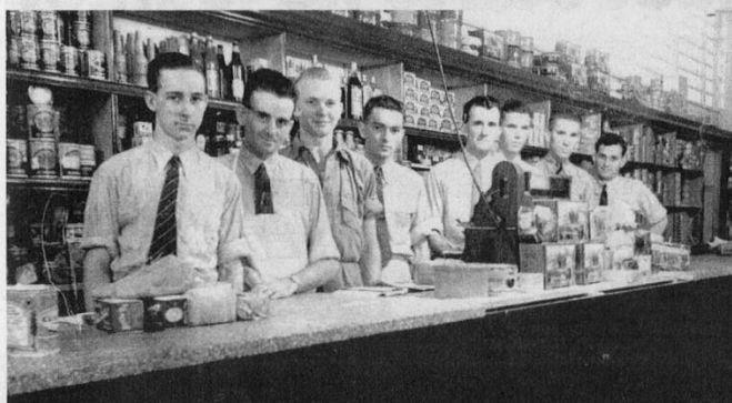
Do you recognise this iconic Currie Street business or the staff in waiting?

THE Sunshine Coast's Discovery Weekend in May provides a wonderful opportunity for residents and visitors to reflect on the past and the progress achieved over the years.