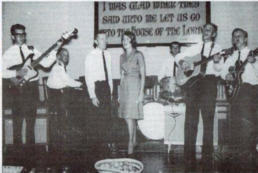
Bands like The Mercy Beats will be fondly remembered as Nambour Museum presents its Swinging Sixties Open Day on September 17.

and Maroochy District Band were in great demand during the 1960s with regular competitions, performances for special events and street parades. Nambour's amazing Marching Girls were based in